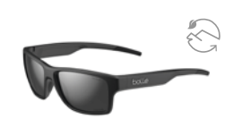
BS043002 CAT.3 Black Matte Volt+ Gun Polarized