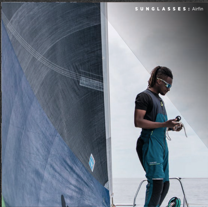
SUNGLASSES : Airfin