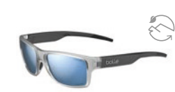
BS043001 CAT.3 Light Grey Frost Volt+ Offshore Polarized