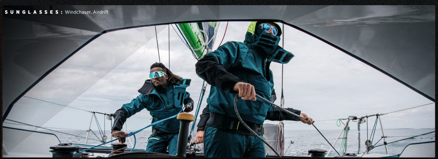
SUNGLASSES : Windchaser, Airdrift