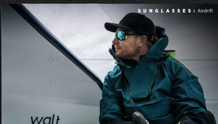
SUNGLASSES : Airdrift