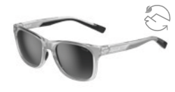
BS051005 CAT.3 Crystal TNS Gun