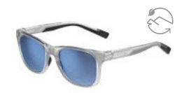
BS051001 CAT.3 Crystal Volt+ Offshore Polarized

The STATUS is a classic medium rectangular frame with Bollé's design. Modernized with a metal logo, this model is equipped with high-performance features such as snap hinges and Thermogrip® rubber on both temple tips and the nose pads. A part of our React for Good campaign, the STATUS is made of 45% bio-based material. Available with Volt+, Bollé's revolutionary high contrast and polarized lens.