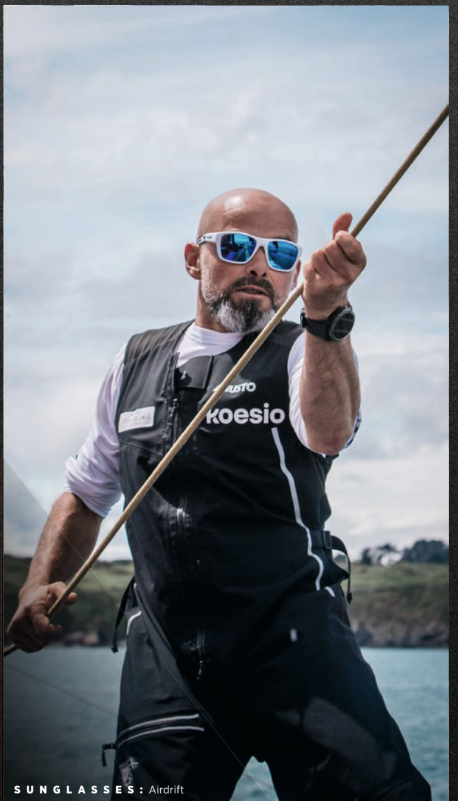
SUNGLASSES : Airdrift